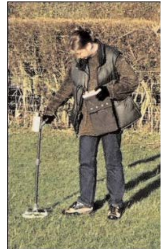
Operator using the Bartington MS2 Instrument and MS2D field coil.

Magnetic susceptibility surveys using the field coil cannot determine between anthropogenic or natural enhancement. However topsoil samples may be taken and analysed in a laboratory to clarify the likely origin of any enhancement.